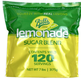
Bill's Original Sugar Blend 2 Bags | 240 Servings