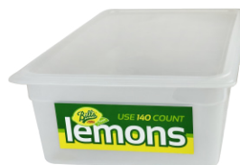
Lemon Storage Bin 1 Unit | w/ Lid (Cambro)