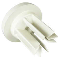
Sectionizer Plunger 1 Unit | Upper Part (Sunkist)