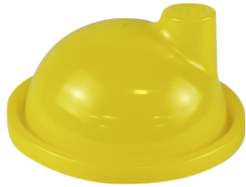
Yellow Dome Shaker Lid 740/Case