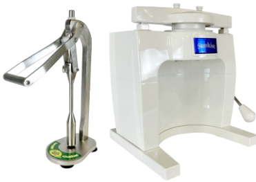
Equipment Package 1 Crusher / 1 Sectionizer