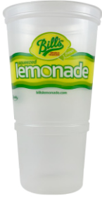
Bill's Lemonade Original Cups 740/Case | 30 oz