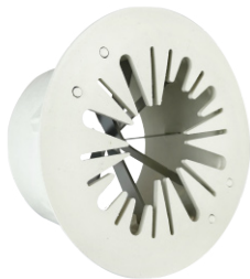
8 Wedge Blade Cup 1 Unit | (Sunkist)