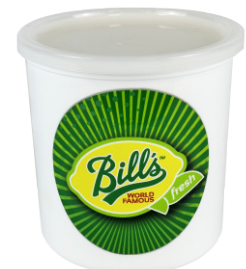
White Plastic Straw Holder 1 Unit | (Cambro)