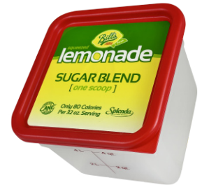
Sugar Blend Container 1 Unit | w/ Lid (Cambro)