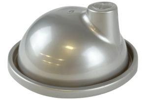
Silver Alcohol Dome Shaker Lid 740/Case