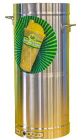
Purified Water Serving Station 5 Gallon