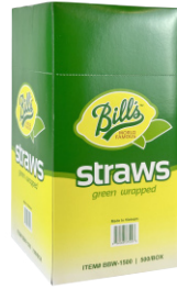
Wrapped Thick Green Straws 1500/Case