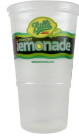
Bill's Alcohol Hard Cups 740/Case | 30 oz