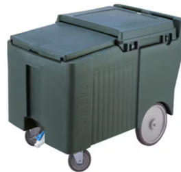
Insulated Ice Caddy Green / 175 LB. Capacity (Cambro)